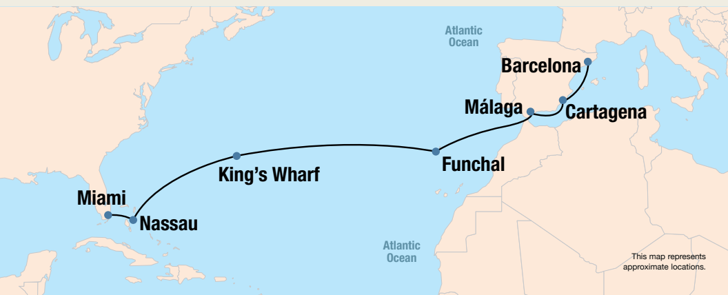
This map represents approximate locations.

With a marvelous blend of rugged volcanic peaks, fragrant botanical gardens and lush valleys, it's no wonder Madeira is called the "Island of Eternal Spring." From the picturesque capital of Funchal, a cable car ride to Monte affords awe-inspiring vistas of Funchal Bay, and a drive along the scenic coast offers a chance to see the quaint fishing village of Câmara de Lobos and Cabo Girão, the second-highest sea cliff in the world.