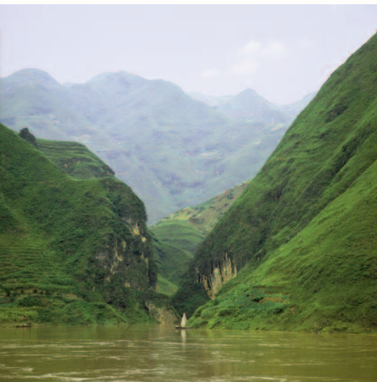
Left: Yangtze River | Right: Shennong Lesser Gorges