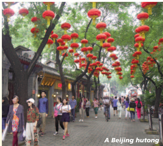
A Beijing hutong