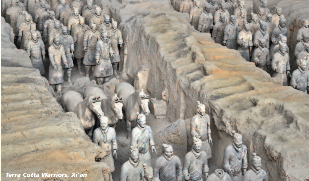
Terra Cotta Warriors, Xi'an

This afternoon, disembark in Yichang, fly to Hangzhou and check in to the JW Marriott Hotel.