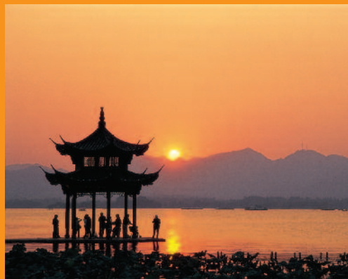
Left: Markets and shops, Shanghai