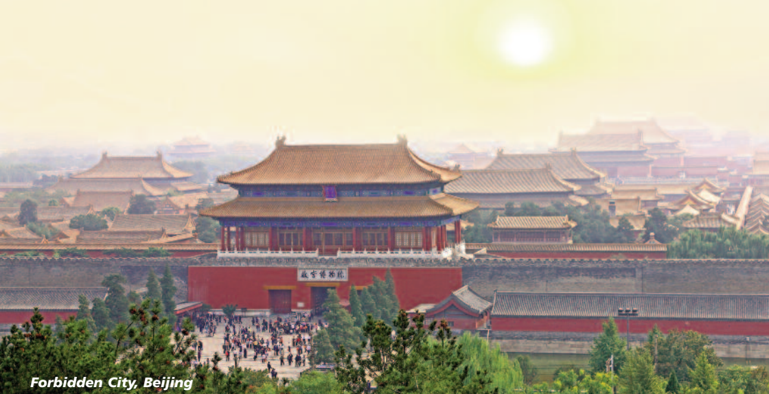
Forbidden City, Beijing