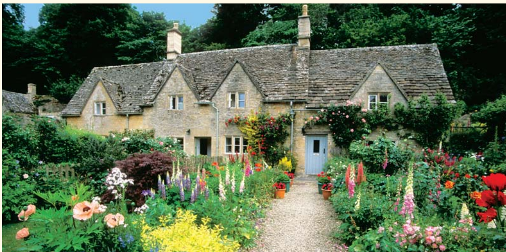
Romantic gardens and classic stone houses are part of many English traditions that live on in the Cotswold and Oxfordshire villages, a bastion of beauty, history and culture.

Nestled inside the scenic Vale of Evesham, medieval Chipping Campden was built on the “white gold” wealth of the wool merchants, who left behind the soaring 15 th -century Gothic tower of the Church of St. James and wool-tycoon manors, including the 14 th -century Grevel House.