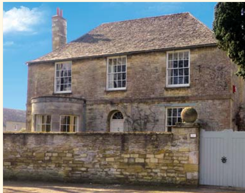
PBS's MASTERPIECE series Downton Abbey portrays Church Gate House as the home of Lady Crawley.

Affectionately named the "city of dreaming spires" by adoring poets, Oxford is home to Britain's most venerated university which counts Sir Thomas More, Percy Bysshe Shelley and Margaret Thatcher among its illustrious alumni. Steeped in eight centuries of history and erudition, Oxford continues to nurture great scholars while blending its revered traditions with cutting-edge research and instruction provided by many of the world's brightest minds. Here, the exclusive customs of a Formal Hall dinner require proper attire, or college gowns, and are still honored with a three-course meal and waiter service. Magnificent cobblestone squares, medieval alleyways and Renaissance quadrangles fill the grounds of the oldest university in the English-speaking world.