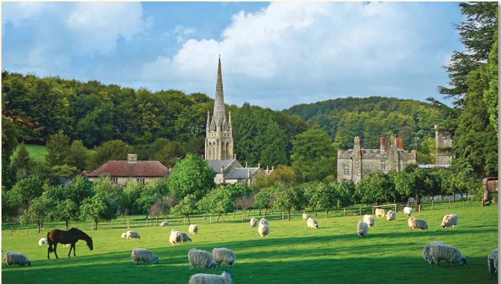
The long twilight glow of a perfect English summer evening sweeps over Chipping Campden, a serene, quintessential Cotswold village with a deep-rooted history in the wool trade.