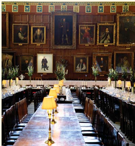
Your Farewell Dinner will be held in one of Oxford's oldest and most beautiful dining halls.

Here villagers carry on along High Street, which retains its old English character.