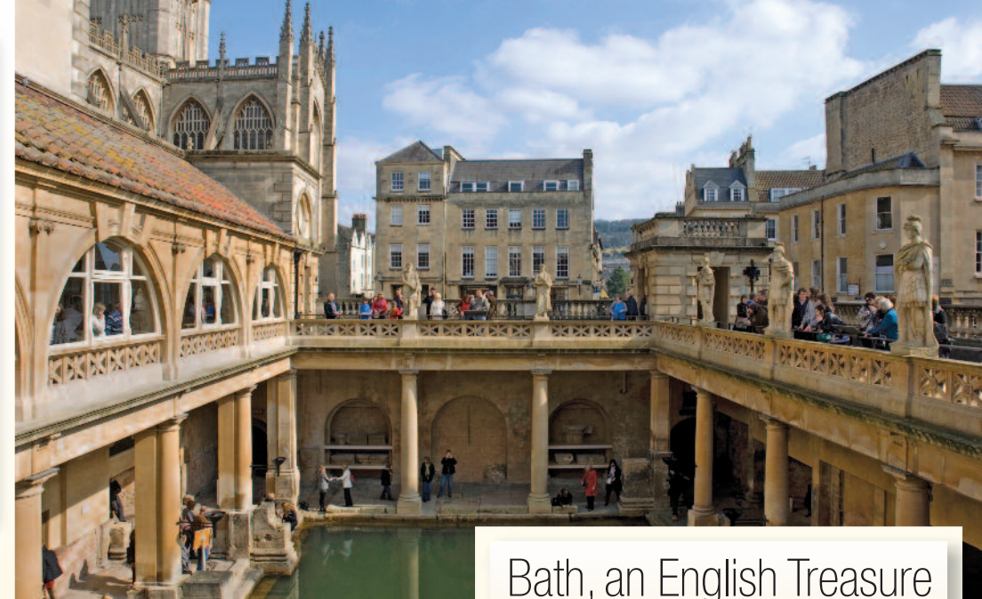
Roman Baths, Bath

From St. Paul's Cathedral to the Tower of London, explore the storied streets of this district. Afterward, tour Shakespeare's Globe, a faithful reproduction of the original theater.