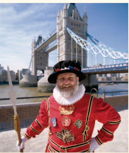
Top: Buckingham Palace | Above: Beefeater, Tower Bridge

The Palace of Westminster and Westminster Abbey and the City of Bath are UNESCO World Heritage sites featured in this program.