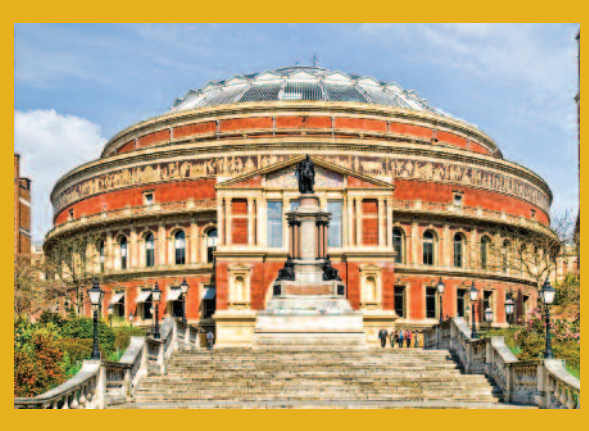
Royal Abert Hall

Our personalized air program allows you to select your flights, routing, class of service and dates of travel in consultation with one of our experienced Passenger Service Representatives. Airfares will vary, depending on airline, routing and class of service. In most cases, transfers between the airport and hotel/cruise ship will be included on arrival and departure days. Your Passenger Service Representative will provide you with all of the details you need to guarantee your transfer. Book your air with us to ensure assistance in the case of schedule changes or delays that may impact your air travel plans.