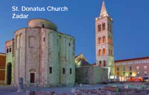
St. Donatus Church Zadar