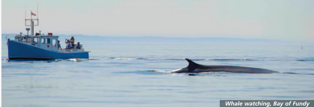
Whale watching, Bay of Fundy