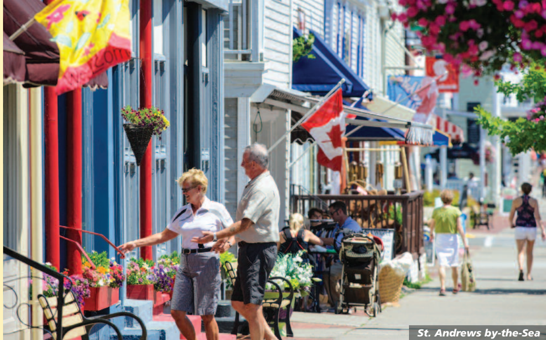
St. Andrews by-the-Sea

Independent Exploration: The morning is at leisure to enjoy the Campobello park grounds. Stroll on one of the nature trails, play a round of croquet or enjoy a book on the porch of your cottage.