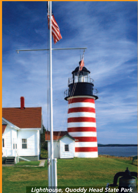
Lighthouse, Quoddy Head State Park