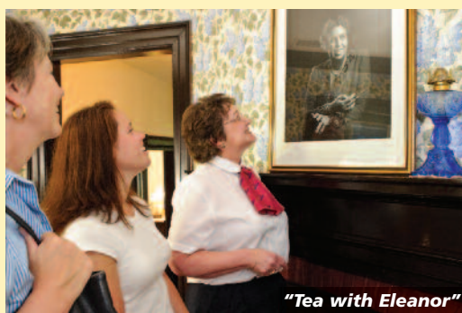
"Tea with Eleanor"

Educational Focus: FDR's Summer Retreat. Delve into the history of Campobello Island. Stroll through the gardens and grounds of Roosevelt Campobello International Park, which is owned and operated by both the United States and Canada. The park is centered around Franklin D. Roosevelt's 34-room "cottage." The home, typical of the turn-of-the-century cottages built by the wealthy summer residents, is filled with original memorabilia.