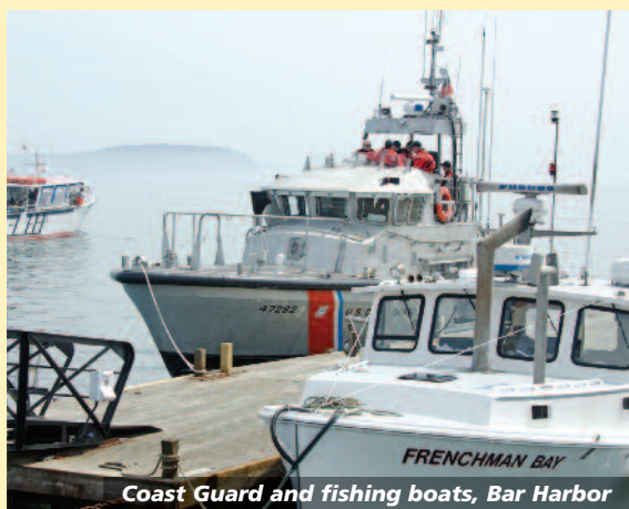
Coast Guard and fishing boats, Bar Harbor

The first settlers arrived here in 1763, and the town gained notoriety as a playground of the rich and famous during the mid-1800s when several of the United States’ most powerful families — the Astors, Rockefellers,