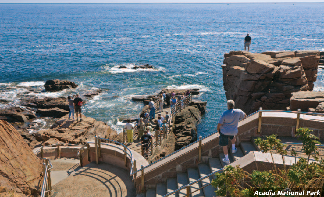
Acadia National Park