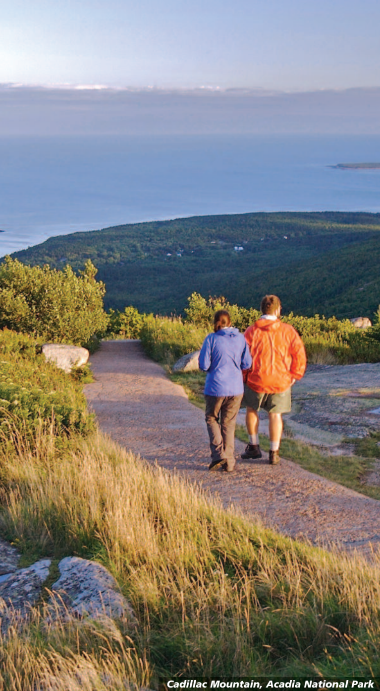
Cadillac Mountain, Acadia National Park