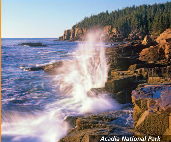
Acadia National Park

† Provided for AHI FlexAir participants.