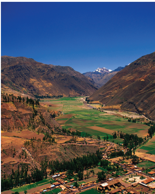
The beautiful and historic Sacred Valley

Day 15: Depart for U.S. We transfer to the airport this morning. You will arrive in the U.S. and connect with your flights home or overnight in Miami. B