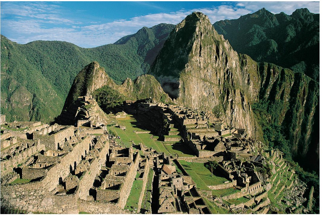
Tour the enigmatic ruins of Machu Picchu.

Day 6: Machu Picchu/Cuzco Today before the day trippers arrive we take our second guided tour of this UNESCO World Heritage site. Then we return to Aguas Calientes for lunch and free time before our mid-afternoon train to Cuzco. B,L