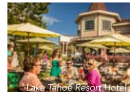
Lake Tahoe Resort Hotel