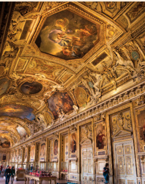
Above: Inside the Louvre

Many visitors to Paris have just enough time to zip through the top attractions. The fortunate ones have time to live like a Parisian and relish the moments. Relax with a warm croissant and a morning paper in a timeworn café. Wander the flower market on peaceful Île de la Cité. Go underground to see the eerie catacombs or find the gemlike Sainte Chapelle and be dazzled by the heavenly stained glass on a sunny day. Observe the proper culinary rituals, including a break at legendary Ladurée for melty, rainbow-colored macarons or ice cream from Berthillon, followed by a pleasant stroll on Île Saint-Louis. Spend time procuring the perfect picnic ingredients: wine, berries, an oven-fresh baguette and cheeses from a fragrant fromagerie. Find the right picnic patch at Luxembourg Gardens, the gardens behind Les Invalides or the elegant Place des Vosges. At dusk, stroll the banks of the Seine or rest on the grassy Champs de Mars and wait for the moment when the lights illuminate the Eiffel Tower. Seek out live jazz at low-key, lamp-lit clubs and dip into warm moelleux au chocolat at a neighborhood bistro where French couples linger late into the eve.