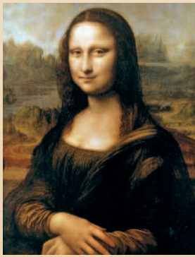
Right: Mona Lisa, Louvre