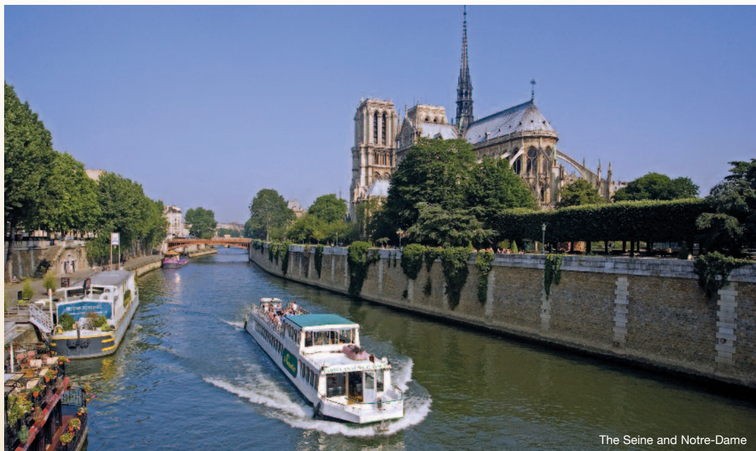
The Seine and Notre-Dame

Grand and glamorous, epic and dramatic, stylish and cosmopolitan, Paris is perhaps the most magnificent city in the world. The iconic architecture, artistic treasures, unparalleled cuisine and century upon century of history can leave a rushed traveler breathless. But take the time to stroll its intimate quarters, chat with neighborhood shopkeepers and unwind in tranquil churchyards and gardens and you'll come to know Paris' village-like soul. Each intimate quarter has its own sagas and legends; its own exuberant mood and rhythm; its own romantic side streets. Spend 10 nights in Paris and the memories will stay with you forever.