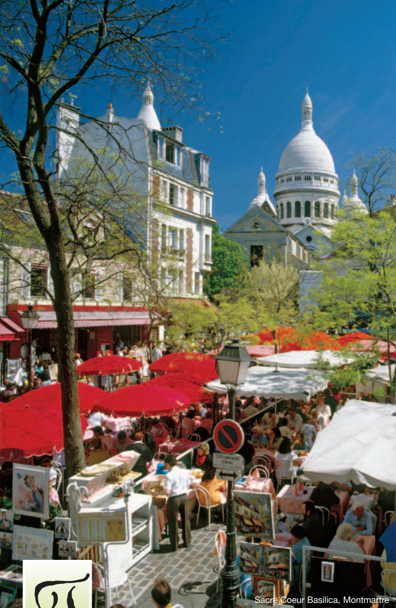
Sacré-Coeur Basilica, Montmartre