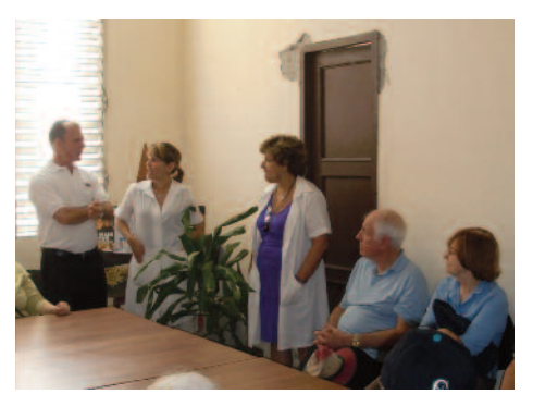
Medical clinic visit