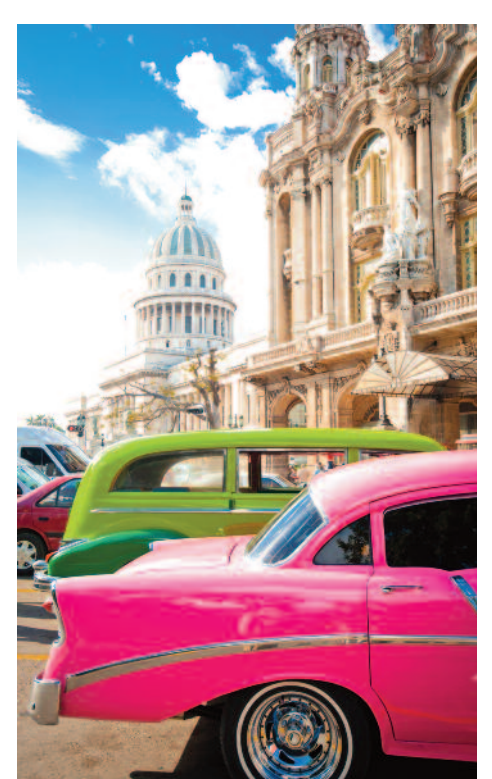
Clockwise: Tobacco fields, Cuban countryside; local woman; Havana

Cuba in all of its color, controversy and history is now open for you to discover in an exciting journey to this fascinating country. There is no better way to discover Cuba than through its people, their culture and their art. Feel the hope of Cuba's youth through its energetic young dancers and musicians. Experience the strength and spirit of older generations through their openness and warmth. Marvel at opulent colonial architecture frozen in time as much as Cuba's vintage automobiles. The Bay of Pigs bakes in the Caribbean sun now as Cuba moves into the 21st century. Jump at the chance to see this amazing place and share personal moments with its people.