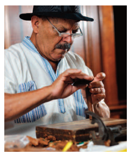
Rolling fine Cuban cigars