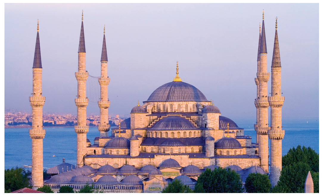
Istanbul's Blue Mosque combines Ottoman and Byzantine design.

Grand Bazaar, housing some 5,000 shops along 60 "streets." The remainder of the day is free for independent exploration. B