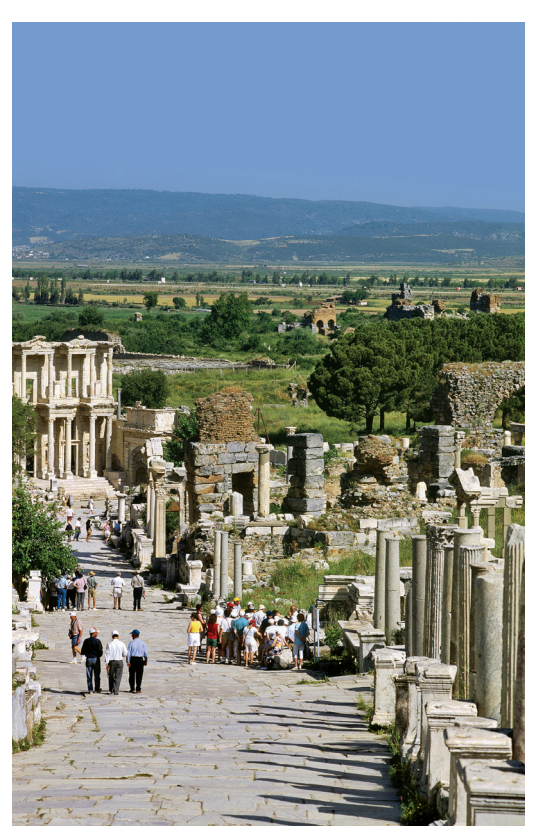
On Day 8 we visit the impressive ruins at Ephesus.