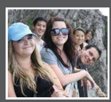
May 29 - June 16, 2015 extended tour ends June 21