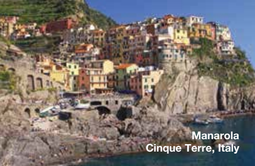
Manarola Cinque Terre, Italy