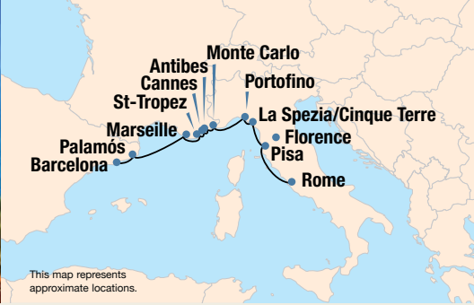
This map represents approximate locations.