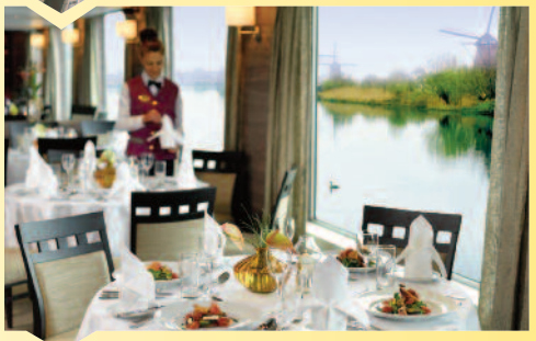
Upper: Each cabin features a river view Lower: MS Amadeus Silver restaurant