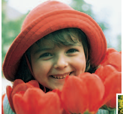
Top to bottom: Windmill Young Dutch girl Painting by the Dutch Master Vermeer Amsterdam Cover photo: Bruges