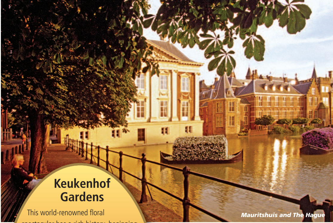
Mauritshuis and The Hague