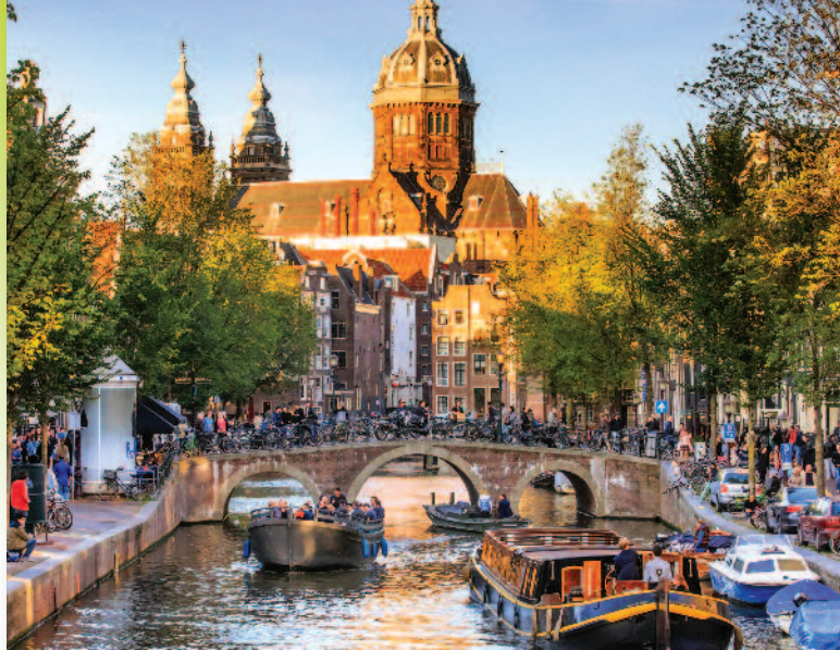
Left: Amsterdam Below: Flower seller