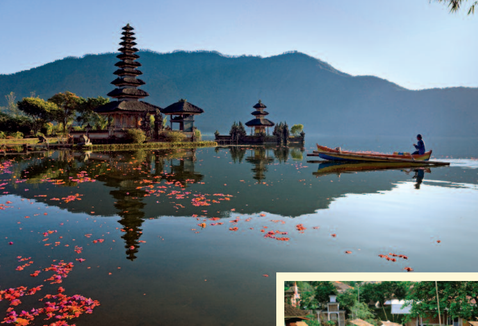
Left: Bali Below: Ubud market