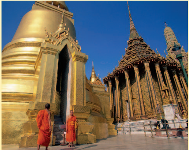
Above: Wat Phra, Grand Palace, Bangkok

Excursion: Ayutthaya. Take a leisurely cruise of the Chao Phraya River to Bang Pa-In, the extravagant royal Summer Palace surrounded by manicured gardens, and the ruins of Ayutthaya, the grand capital of Siam