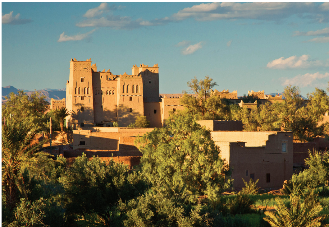
A typical kasbah, as we see along the “Route of a Thousand Kasbahs” on Days 9 & 10.

its 17th-century synagogue, the royal gates, and the Museum of Fez. Tonight we enjoy a private dinner at an intimate family-run riad in Fez. B,L,D