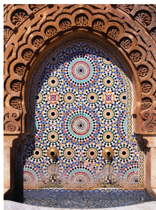
Traditional Moroccan tile

Following a tour of the gardens we visit the newly renovated Berber Museum there, with art and