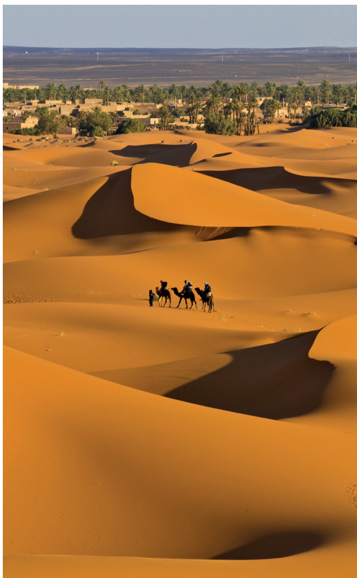
We watch the sun set over the dunes at Merzouga.

Day 14: Depart for U.S. After breakfast this morning we transfer to the airport for our return flight to the U.S. B