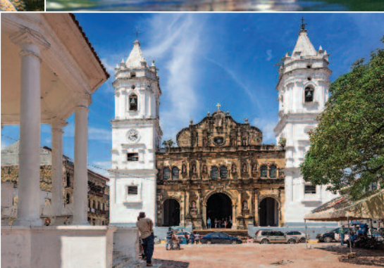
Above left: Coral reef and sea life, Costa Rica Above: Panama City; Top: Costa Rica

A port call on Coiba Island, the largest island in Central America, gives you the opportunity to experience Coiba National Park. A Panamanian penal colony until 2004, this beautiful island is mostly covered with