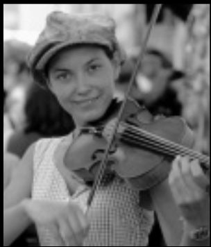
Top to bottom: Roman amphitheatre, Arles Street musician Provençal storefront Cover photos (clockwise): Provençal market in Aix-en-Provence; Les Baux; Cézanne; Lavender field