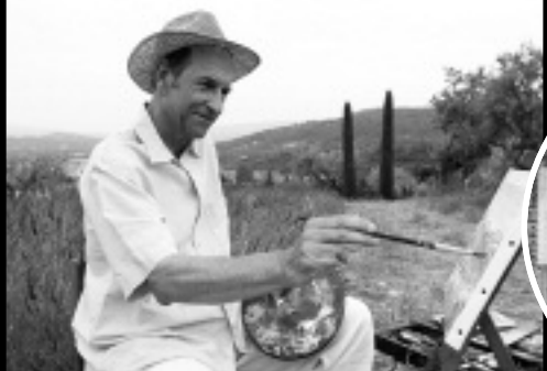
Palais de Papes, Avignon