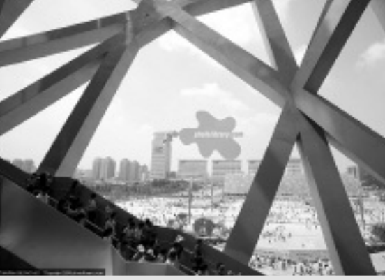
Far Left: Temple of Heaven, Beijing Left: View from inside the Bird's Nest, Beijing Lower left: Peking Opera actor, Beijing Below: T'ang dancer, Xi'an