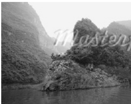
Below: Three Gorges