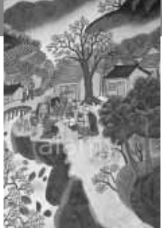
Peasant painting, Huxian