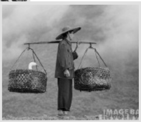
Upper left: Market, Shanghai

This morning, the ship sets a course for Yichang. Cruise through the spectacular Three Gorges region.