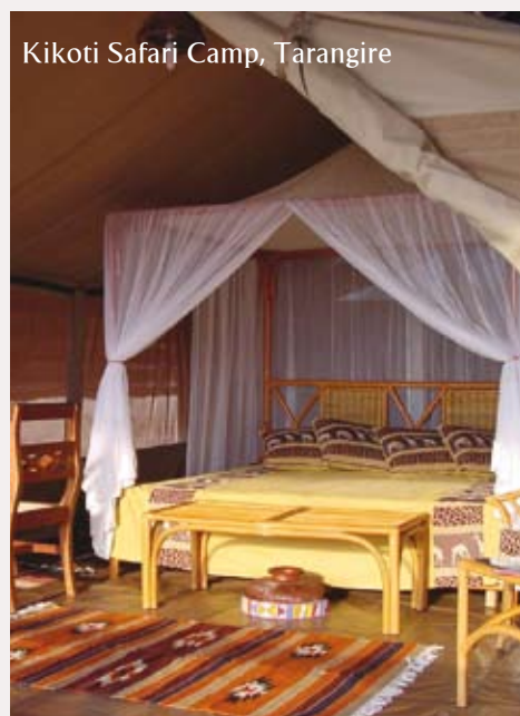
Kikoti Safari Camp, Tarangire

To sleep under canvas deep in the African wilderness is truly a unique and unforgettable experience. Safari Legacy's private tented camp consists of eight spacious walk in tents with large wooden beds with fresh cotton bedding. Private dressing room, water closet with flush toilet and hot showers are all ensuite. All electricity is provided by solar power. Our canvas luxury is enhanced by a dedicated safari crew and well trained chefs who prepare some of the finest cuisine in our separate dining tent. Outside, the open veranda is shaded, with canvas chairs and reading table. The camp is strategically located to ensure the best wildlife viewing possible, as well as maintaining sensitivity to the surrounding environment.