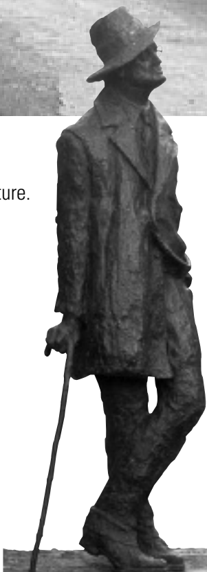
James Joyce statue, Dublin