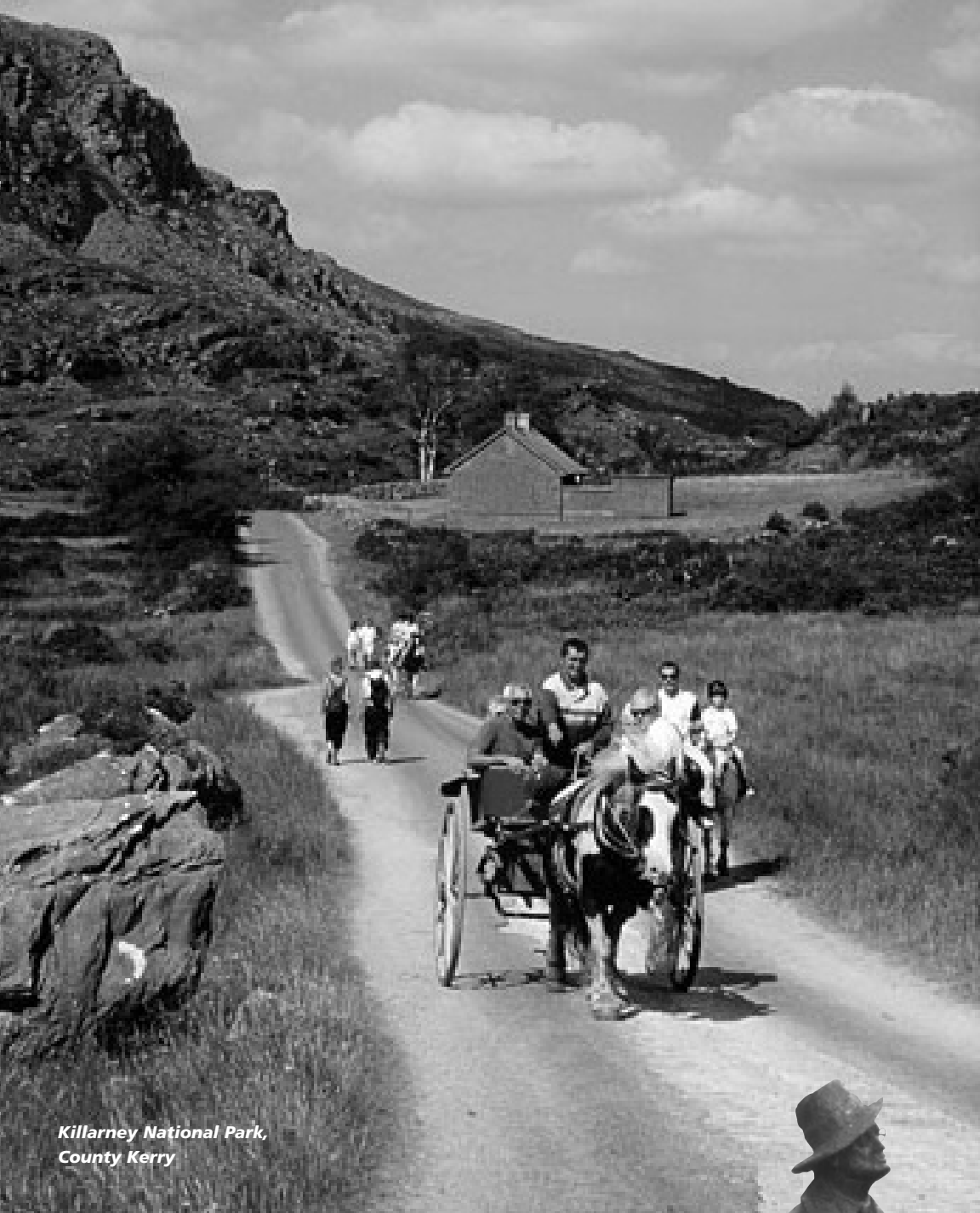
Killarney National Park, County Kerry