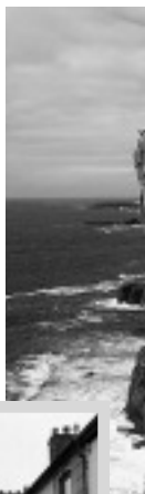
Right: Ruins of Dun Aengus, ancient fortress perched on a cliff, Inishmore