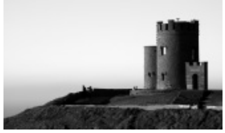
Below: O'Brien's Tower, Cliffs of Moher