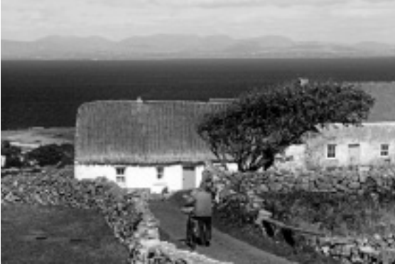
Left: Inishmore, Aran Islands