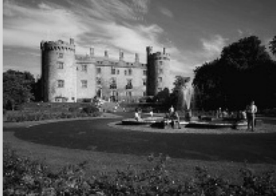
Left: Kilkenny Castle