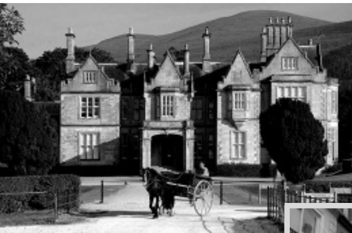
Left: Muckross House